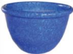
Gloss juicy blue