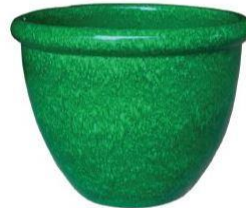
Gloss juicy green