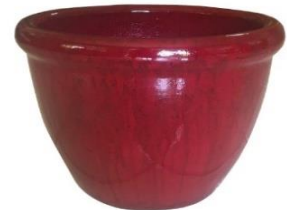
Gloss juicy red