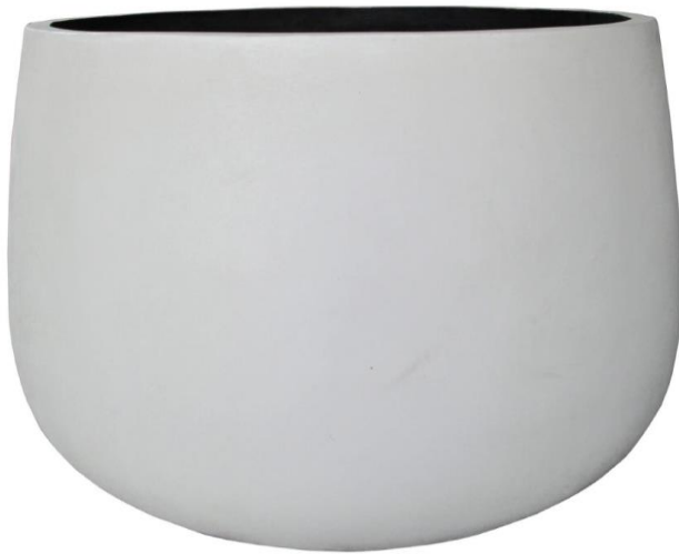
Bunge GRC (1-6)