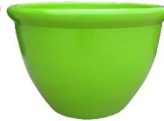
Gloss lime green